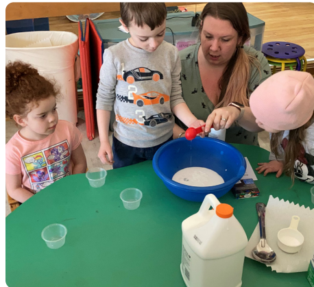
Bridges celebrating Week of the Young Child