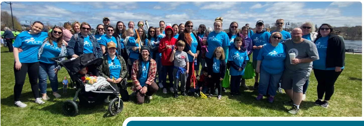
Staff and families at the Walk for Autism

Share your UCP of Maine story: office@ucpofmaine.org