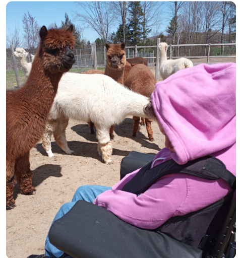
ELC resident at Northern Solstice Alpaca Farm