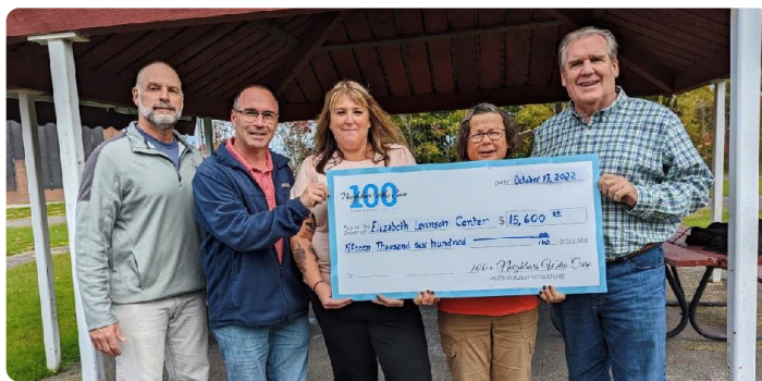
Check presentation by 100 Neighbors Who Care of Penobscot Valley