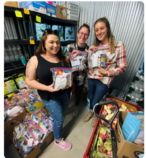
BHH volunteering at Hope for Homeless