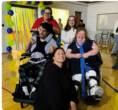
Residential Home clients and staff at our Fall Dance