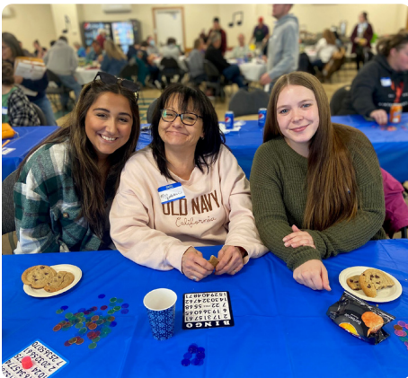
UCP of Maine Staff Day 2022