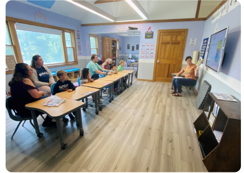
First day of school

to expand our offerings to now serve kindergarten to fourth grade. We will continue working closely with local community schools and creating specially designed instruction for each student. The Success For All curriculum, that we will be using, supports play and social development, as well as including literacy, handwriting, and art." For more information and to set up a tour, call 207-941-2952.